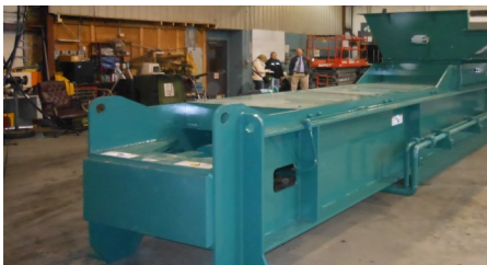
Harris badger LSOS baler in place at the Roane County Recycling Hub.

As Roane County continues to improve our recycling effort, we anticipate seeing much more community involvement. Roane County Government plans to continue to