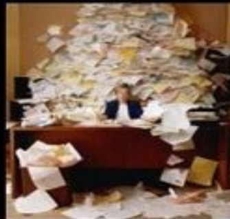
What I think I do.