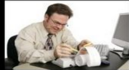
What society thinks I do.