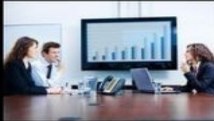
What my mom thinks I do