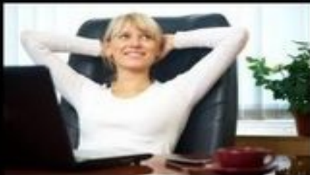
What my boss thinks I do.