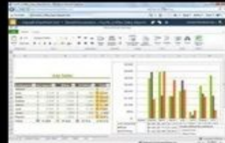
What I actually do.