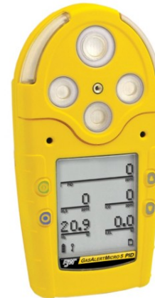
BW Technologies Gas Alert Micro 5IR Non Dispersive Infrared Sensor