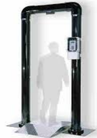
Centurion Radiation Detector