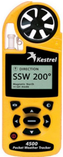
Kestrel 4500 Pocket Weather Meter