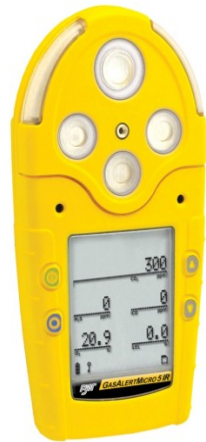
BW Technologies: Gas alert Micro 5 PID For Detecting Volatile Organic Compounds (VOC's)